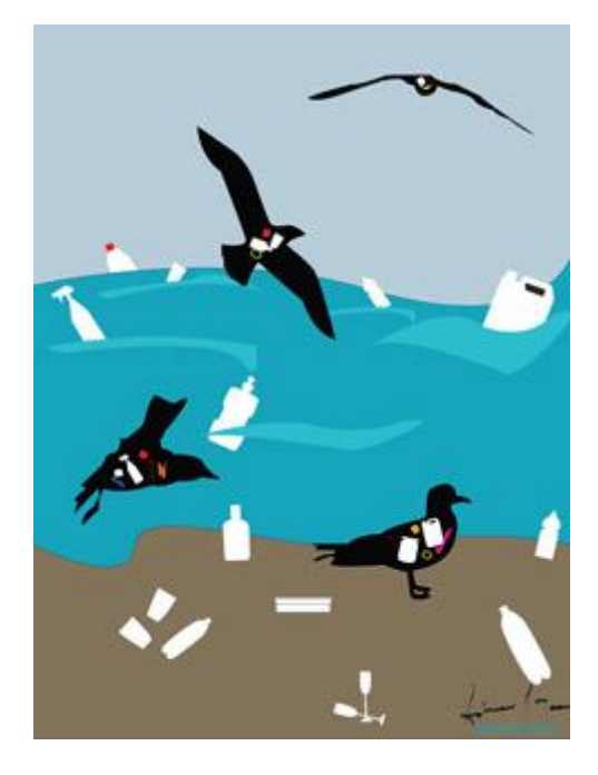
AVOID PLASTIC POLLUTION